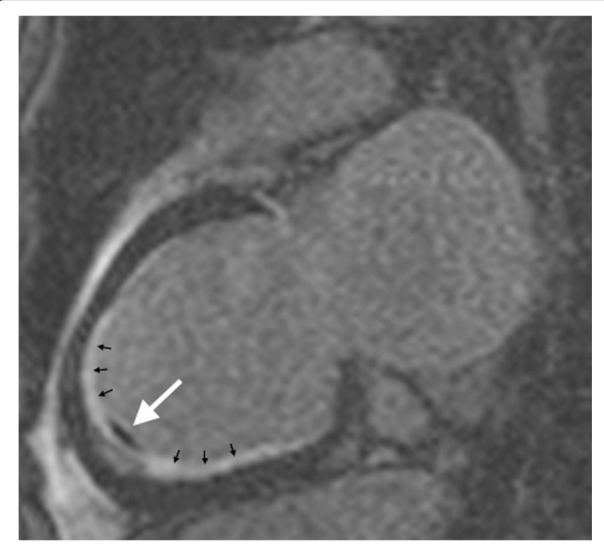
Fig. 1 Cardiac magnetic resonance imaging (1.5 Tesla, 2 chamber view, late gadolinium enhancement, inversion recovery, inversion time [TI]: 190 ms). Cardiac magnetic resonance imaging showing extended semicircumferential subendocardial late enhancement indicating endomyocardial fibrosis (small black arrows) and an apical thrombus (long white arrow)

This patient with the rare diagnosis of EMF outside tropical regions [18], initially was presented with unspecific